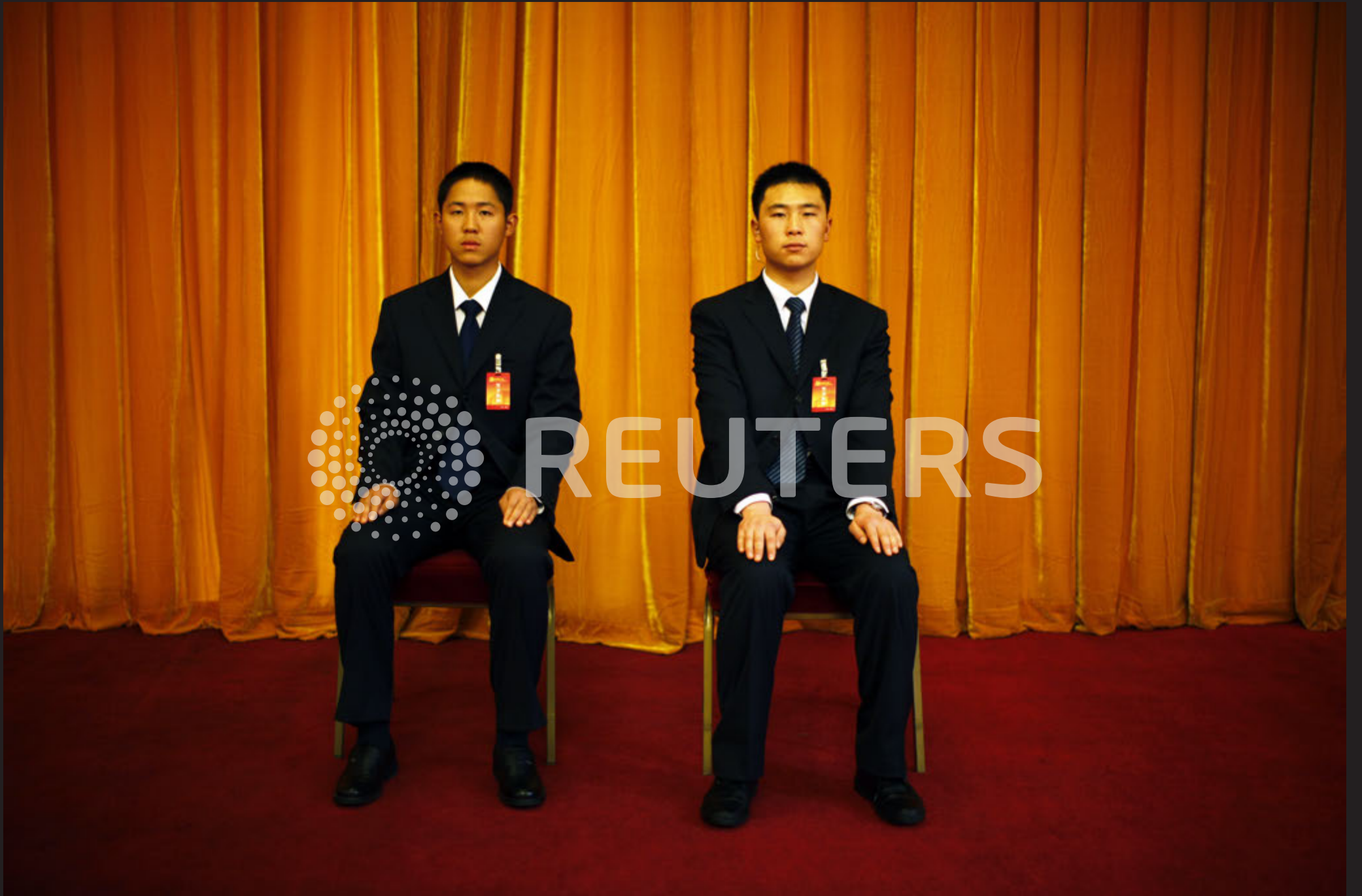
GREAT HALL OF THE PEOPLE Security officers are omnipresent as they stand (or in this case sit) guard outside every meeting venue.