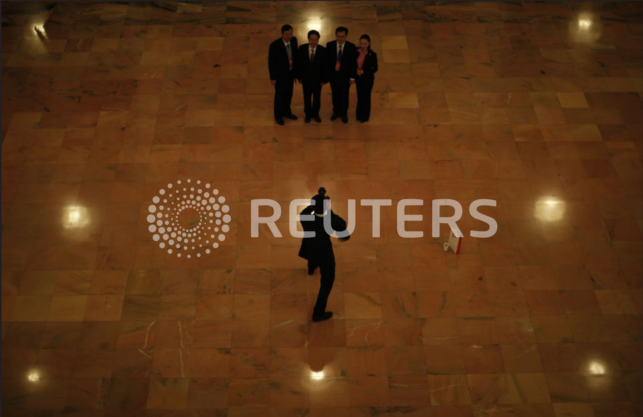
GREAT HALL OF THE PEOPLE Delegates attending the 18th National Congress of the Communist Party of China pose for a group photo.