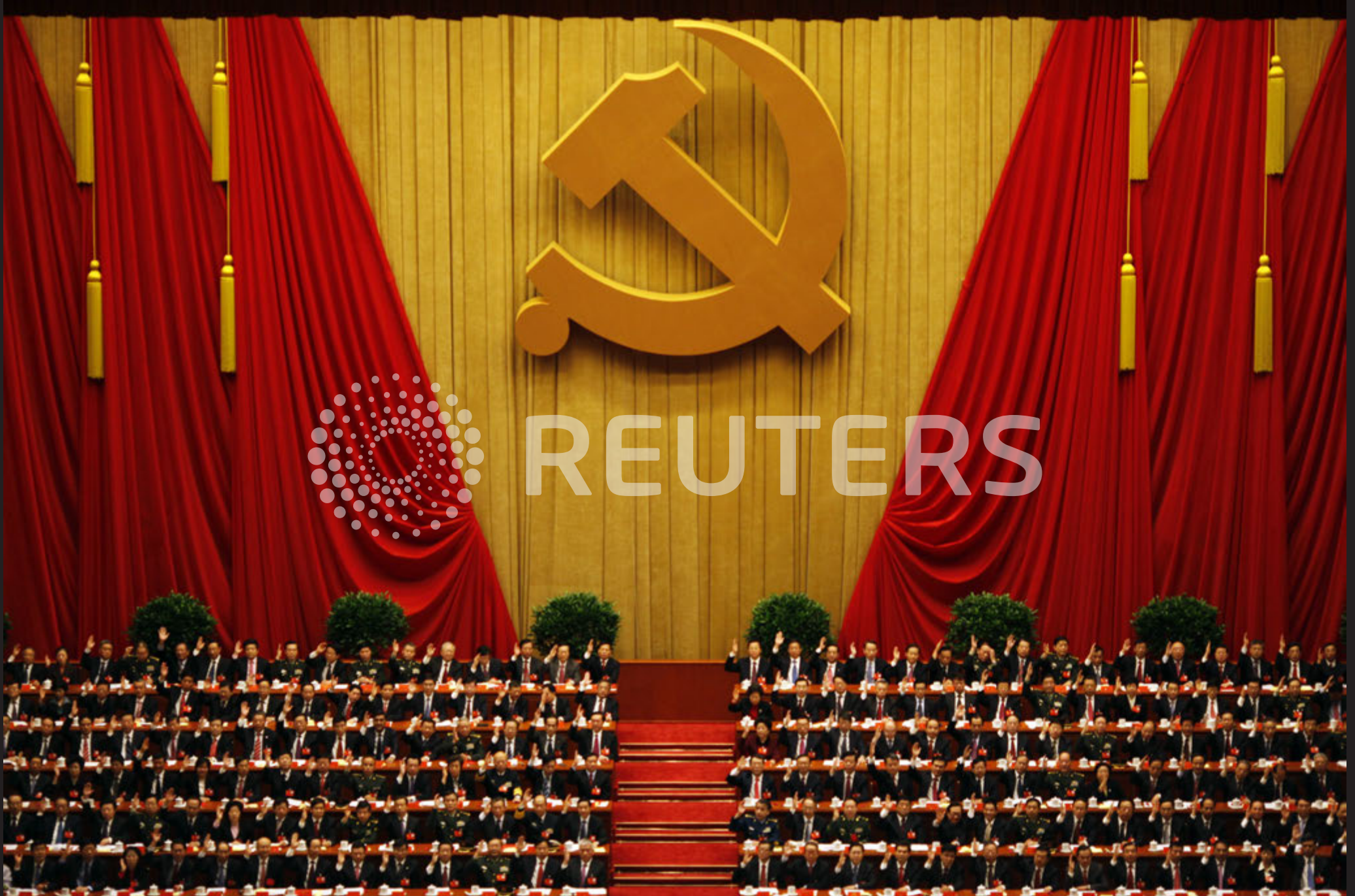
GREAT HALL OF THE PEOPLE Delegates takes a vote at the closing session of the 18th National Congress of the Communist Party of China.