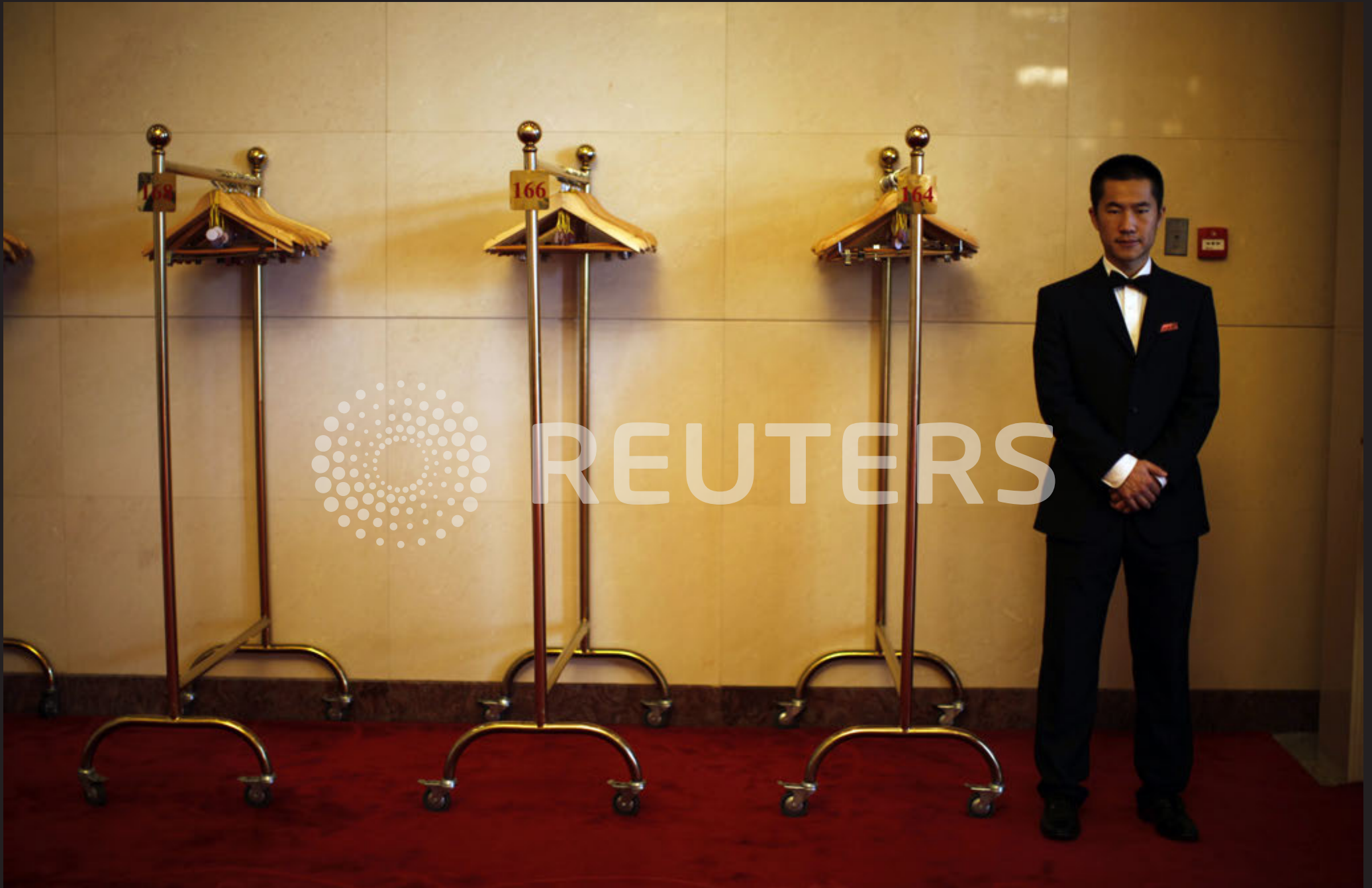
GREAT HALL OF THE PEOPLE A security officer stands guard outside a meeting room.